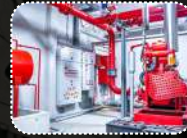
Fire Fighting Systems