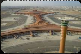
King Abdulaziz International Airport