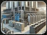
District Cooling Plants