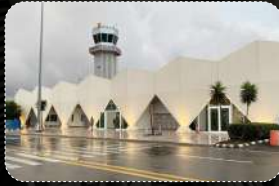
Abha Regional Airport Terminal Expansion