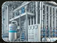
Chilled Water Systems