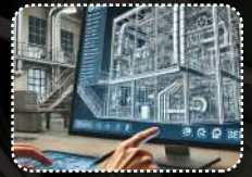
Building Information Modeling