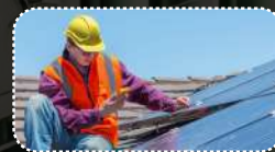
Energy Performance Contracting