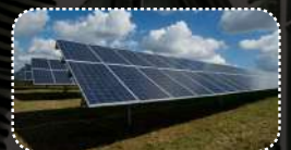
Solar PV Modules