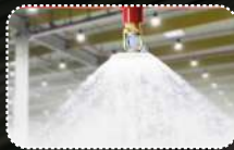
Foam Fire Suppression Systems