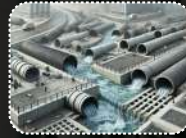
Storm Water Network