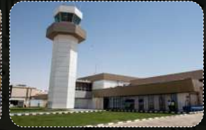
Al Ahsa International Airport