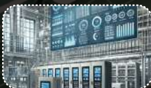
Energy Management & Optimization (EMS)