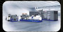
Dynamic Rotary Uninterruptible Power Supply (DRUPS) devices