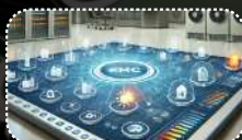
HVAC & BMS