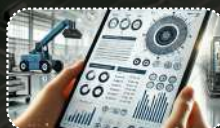
Mobile Data Collection