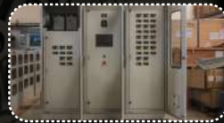
SCADA & PLC Systems