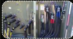
MV and LV Distribution Networks