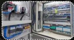
Building Management System (BMS)