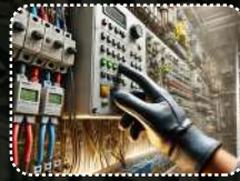
Testing & Commissioning