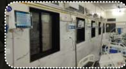
Central Control Monitoring System