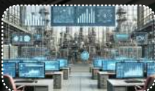
Multiplatform Plant Information Management Systems (PIMS)