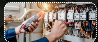
Testing and Commissioning