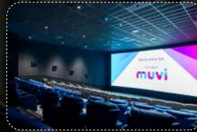
MUVI Cinemas - Taif