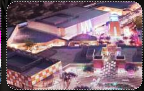
Abha P6 Entertainment Complex