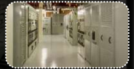
Central Battery System (CBS)