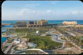
KAEC Fire-fighting System & CCTV Surveillance