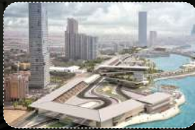
Formula 1 Bridges