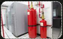
Clean Agent System FM200