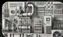
Products & Hardware