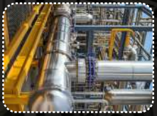
Engineering, Procurement, & Installation