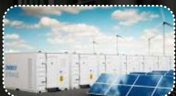
Energy Storage Systems