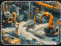
Assembly & Manufacturing