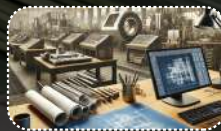
Design & Build