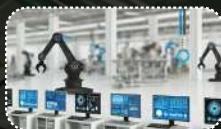
Support for all Automation Systems