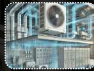
Variable Air Volume Systems