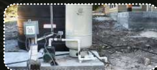
Pump and Tank Installation