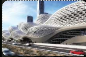
FO & MV Cable Installation for Lines 4 & 5