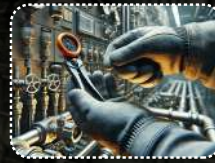
Operations & Maintenance