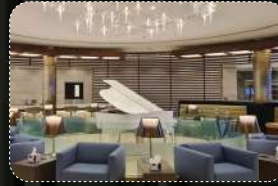
Al Fursan Lounge - Saudi Airlines