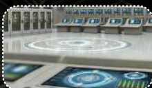
DCS and PLM