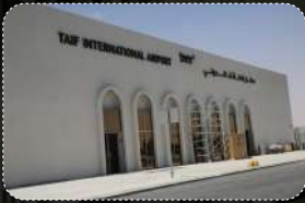
Taif International Airport