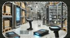
RFID/ Bar Coding