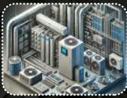
All HVAC Systems