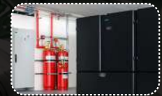
Automatic Fire Extinguishers