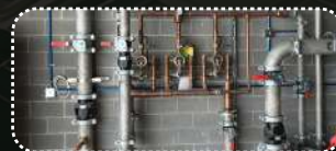
Potable Water Installation