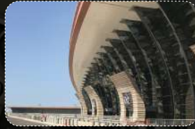
KAIA Royal Terminal