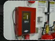
Clean Agent Systems