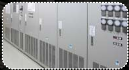
Uninterrupted Power Supply (UPS)