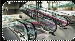
Elevators, Escalators, Moving Walk