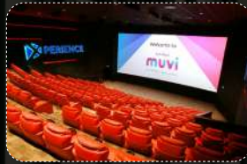
MUVI Cinemas - Yasmin Mall